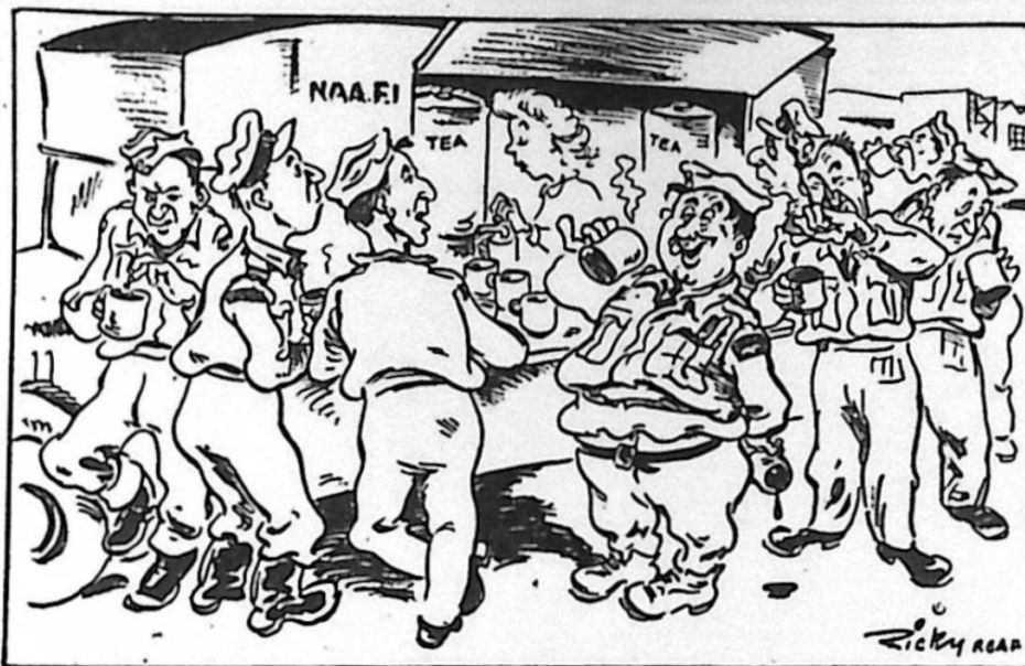
"You've been over a long, long time, haven't you, chum?"

BLACK BULL BOYS Garden Art Display The flower bed in front of SHQ Block is a technicolor witness of Sgt. Major Stan Whitehead's horticultural art.