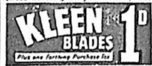
Made from Sheffield's finest and strongest steel in a profit-sharing factory.

No. 1 LATHERING. Most shaving soaps contain an ingredient which softens the stubble. Give it time to work. Your razor blade will last longer if you lather for twice as long as you usually do.